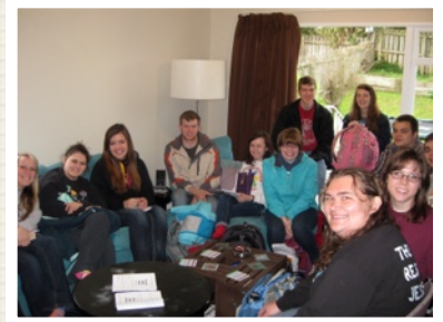
DEVOTION TIME BEFORE A DAY'S WORK